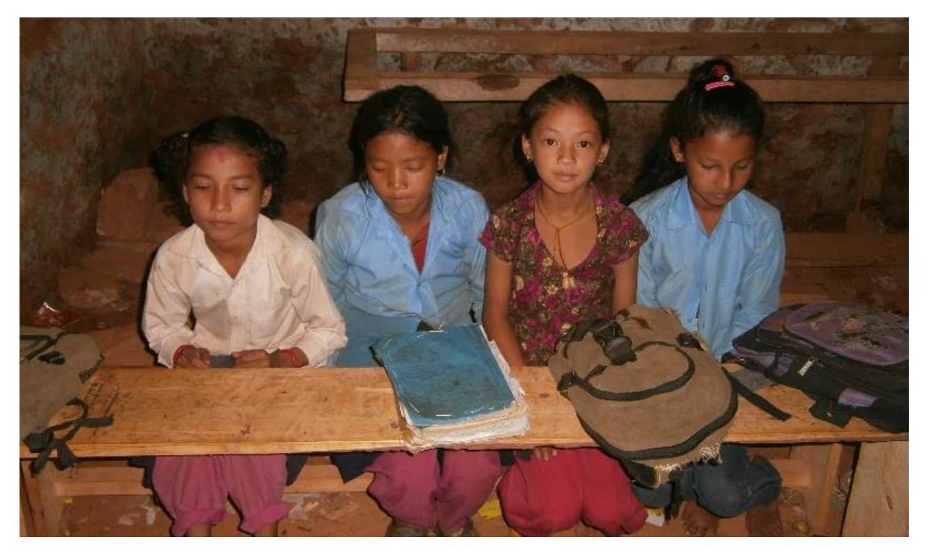
Figure 1 Children in a school from Okhaldhunga waiting for the renovation of class rooms.

Okhaldunga districts have been severely impacted by the earthquake. Assessment findings on the percentage of houses damaged or destroyed range from 40% to 80%. Twenty eight percent of classrooms recently assessed are in school blocks categorized as unsafe. Twenty six out of 50 VDCs and one municipality were identified as priorities for intervention. There is a very limited presence of international relief organisations in the district and most of the response is undertaken by the district government and Nepali NGOs. Shree Dhudkoshi Primary School, Barachande Taluwa-7, Okhaldhunga has been categorized as unsafe to continue the classes by engineers. It leads to uncertain future of 150 kids with deprived from learning. School is in urgent need of support to construct a new safe building.